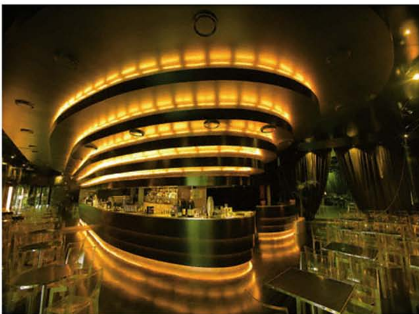
Osram's Representative Application